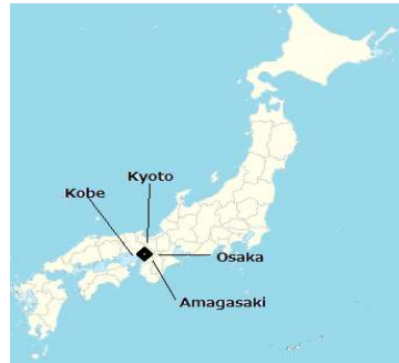
Figure 1: Location of Amagasaki

the factory cannot reconstruct their living. They become a day-to-day living and have no alternatives other than to receive welfare from the municipal.